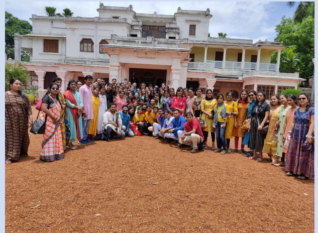
Educational Tour at Vinay Bhavan, Viswa Bharati