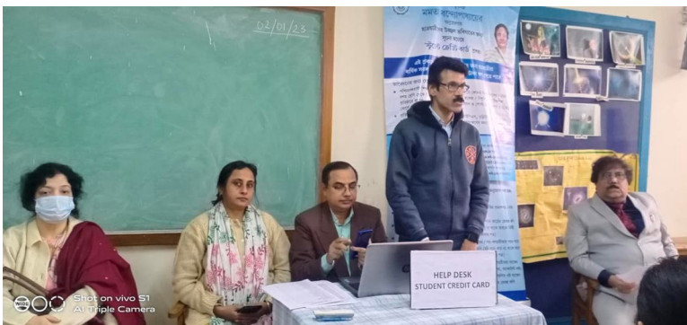
Student Credit Card observation Week