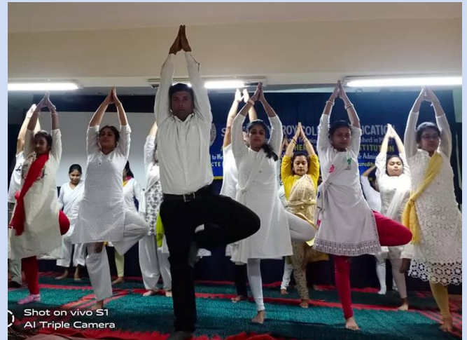
21st June International Yoga Day