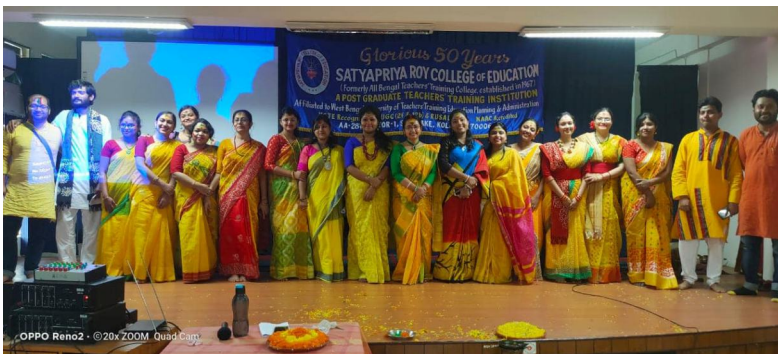
On the occasion of Basanta Utsav March 2020 2