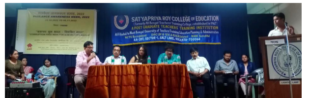
Vigilance Awareness Week Observation