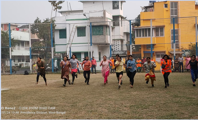
College Annual Sports