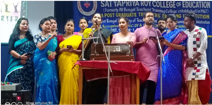
Cultural Programme 2022