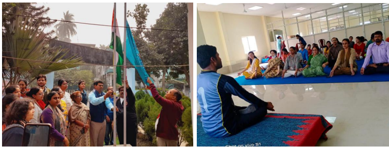
Inauguration of NSS