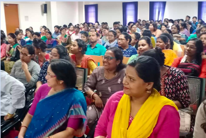
Awareness Programme on Disability