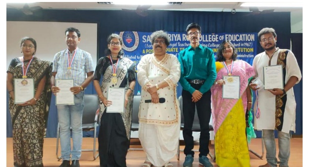
Prize Distribution Ceremony