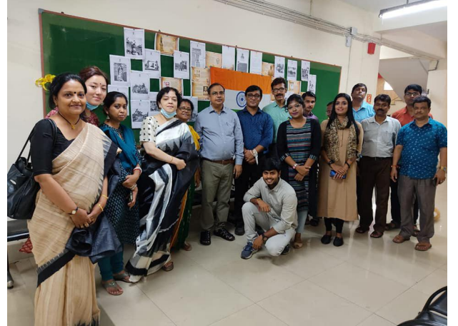
Azadi Ka Amrit Mahatsav